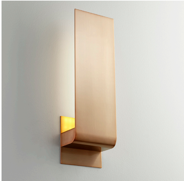
-25 Satin Copper