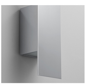
-14 Polished Chrome