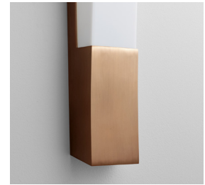
-25 Satin Copper