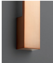
-25 Satin Copper